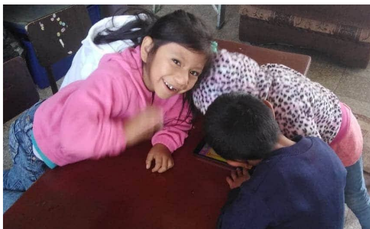
Students sharing learning time with a tablet